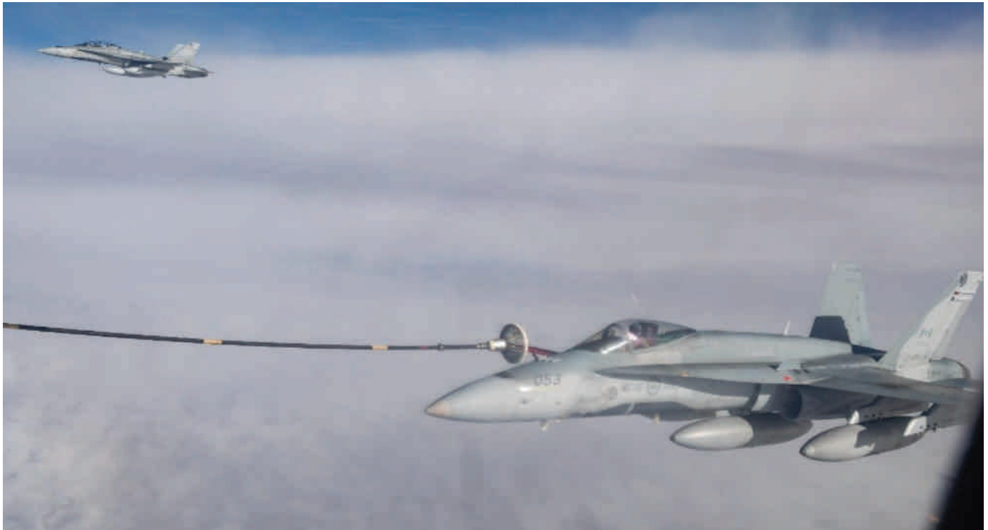
CF-18 being refuelled.

a specialized fuel called JP8 that is a more refined kerosine fuel with toxic chemicals that allow them to fly at faster speeds and higher altitudes compared to commercial aircraft. 105 Unlike a commercial aircraft that is flown by a crew and can carry up to 500 hundred passengers with luggage, a fighter jet is flown by one pilot and carries a dozen missiles or bombs.