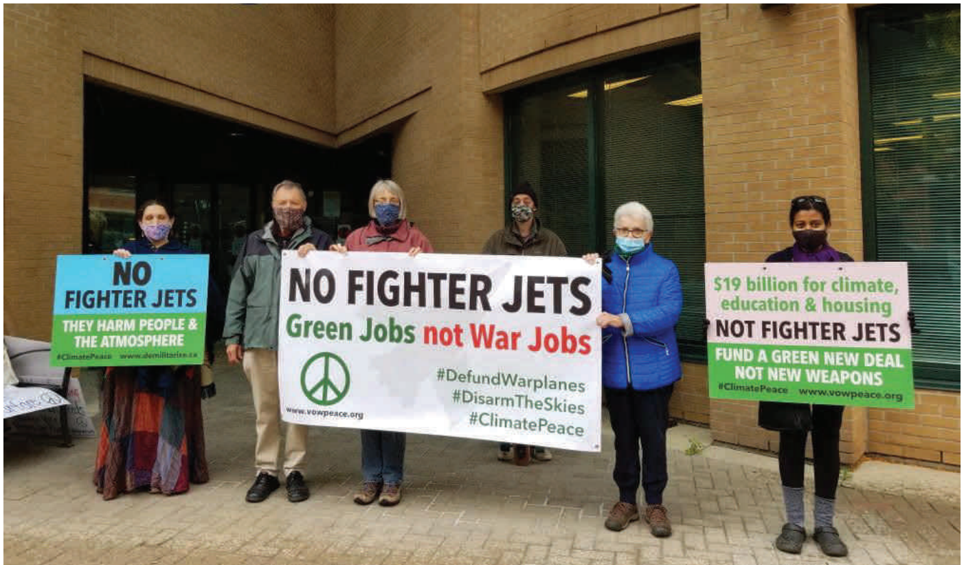
Outside of the constituency office of Member of Parliament Bardish Chagger in Waterloo, October 2020.

Last fall, WILPF Canada and the Canadian Voice of Women for Peace sent a letter “Fighter Jets aren’t Feminist” to the Minister of Finance Chrystia Freeland, the Minister of Defence Anita Anand and the Minister of WAGE Marci Ien. 184 The letter calls on these female government leaders to cancel the procurement and to invest in the priorities of women: ending gender-based violence, investing in affordable housing and healthcare, and taking action on poverty and climate change. It also urges the government to implement the calls to action and justice in the two inquiry reports: Reclaiming Power and Place: The Final Report of the National Inquiry into Missing and Murdered Indigenous Women and Girls and in Honouring the Truth, Reconciling for the Future: Final Report the Truth and Reconciliation Commission . 185