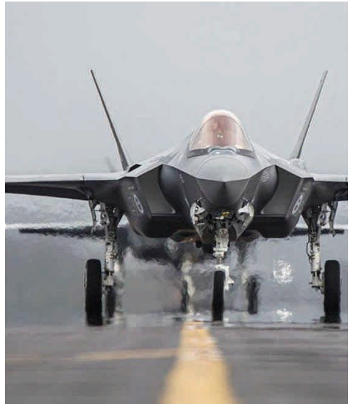
Lockheed Martin F-35 Joint Strike Fighter.

In the same report, the watchdog also found that the F-35 had not yet met the warfighter-required mission capable rate, which means that the plane cannot conduct all the functions it is supposed to perform and the fleet has a very low readiness. In an interview earlier this year, U.S. Air Force chief of staff, General Charles Brown Jr. declared that “The F-35 should become the Ferrari of the fleet: ‘You only drive it on Sundays.’” 71 The out-of-control costs