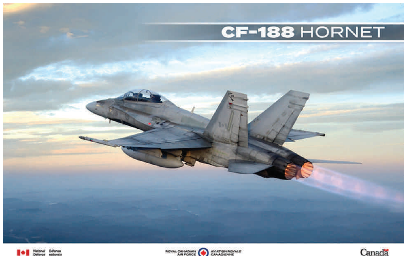
Canada's CF-18.

Some CF-18s are painted in Canadian flag colours, red and white, and used by the 431 Air Demonstration