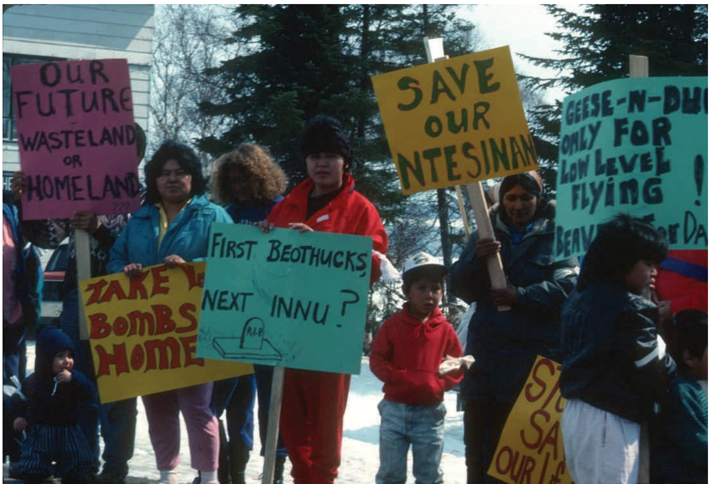
Members of the Sheshatshiu Innu First Nation protesting the NATO low-level fight jet testing in Labrador.

people’s consent. Their traditional territory has been contaminated by mining waste and flooded by dams. The cumulative harm from the dispossession, militarization and industrialization of their land has led to great suffering and serious social problems, such as substance abuse and suicide, for the Innu people. 161 Indigenous women have especially suffered by the arrival of the air force base and the NATO low-level fighter jet training in their territory as will be described in the next section.