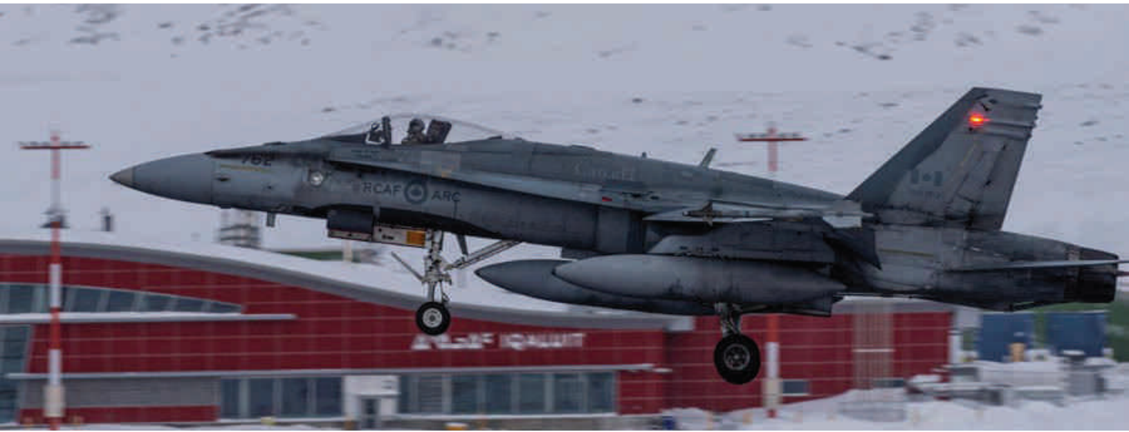
Canada's CF-188 Hornet (also known as the CF-18).